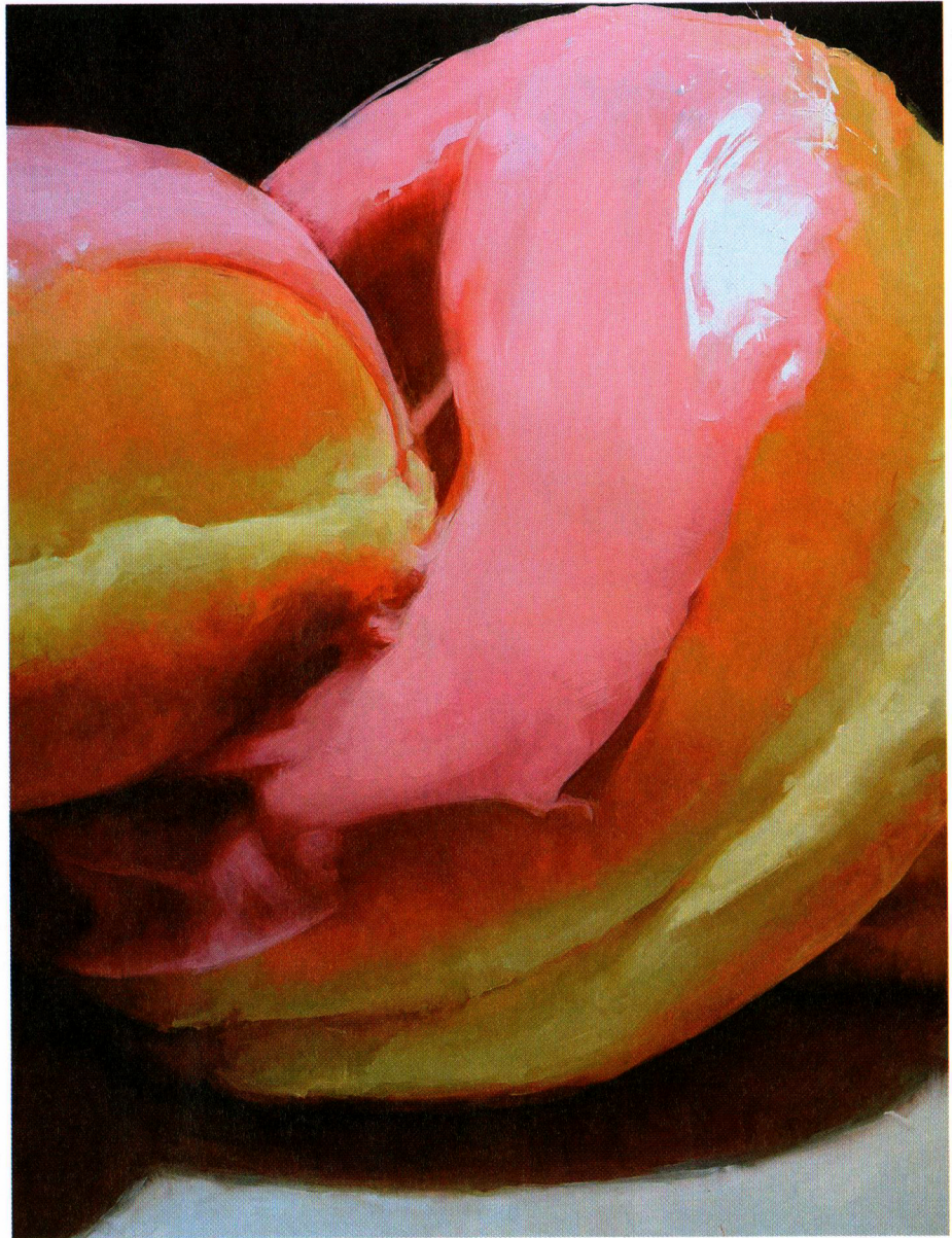
Opposite page, from top: Emily Eveleth, Departures , 2016, oil on canvas, 62 x 84 inches; Wonderland , 2015, oil on canvas, 17 x 23 inches. This page: Big Pink , 2016, oil on canvas, 78 x 60 inches.

One of the artist's new works shows a doughnut hunkered down on a white ledge, split in half, with its raspberry-red filling oozing out of a gaping hole. If Eveleth's subjects often appear as vulnerable as they do exuberant — confident and aware of the beauty of their shimmering surfaces and their tempting voluptuousness — here her portrait "sitter" appears both exultant and