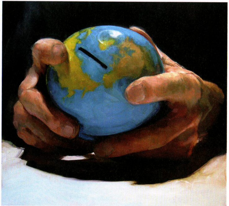
Clockwise from top left: Fold , 2001, oil on canvas, 44 x 42 inches; World Bank , 2010, oil on canvas, 34 x 38 inches; Unintended Consequences , 2007, oil on canvas, 68 x 60 inches.